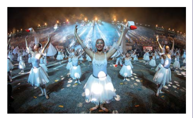
Chingay 2018 held on 23 and 24 February 2018 attracted about 200,000 spectators. Audiences were dazzled by more than 6,500 local and overseas performers at "Cultural Funtasy" , in a highlight of our rich multi-ethnic and cosmopolitan culture. The parade travelled an extended 1.5km route down to the River Hongbao celebrations for the first time which culminated with a free street carnival.

We constantly review our programmes to reach out to a more diverse population. In an increasingly ageing society, we do our part to promote active lifestyles for active agers. Active agers can participate in a broader suite of water sports and lifestyle activities through Silver WaVe . We also look after their mental well-being by addressing their concerns and enabling our seniors as Singapore progressed towards Smart Nation. The PA Senior Academy rolled out a new "Certificate in Seniors for Smart Nation" programme from November 2017 where they could pick up simple coding skills.