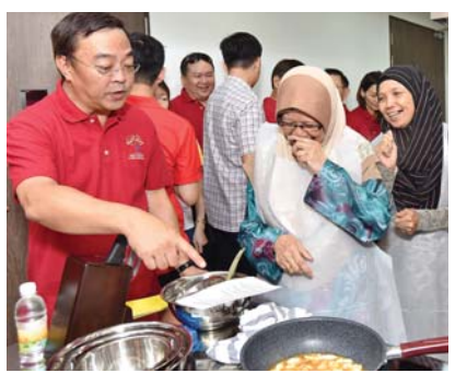
The upgraded West Coast CC reopened on 18 November 2017, with improved facilities and programmes for young families and youth. Residents can enjoy a sheltered basketball court, a mini-theatre and even two new link-bridges that connect the CC to the West Coast Hawker Centre and West Coast Plaza.