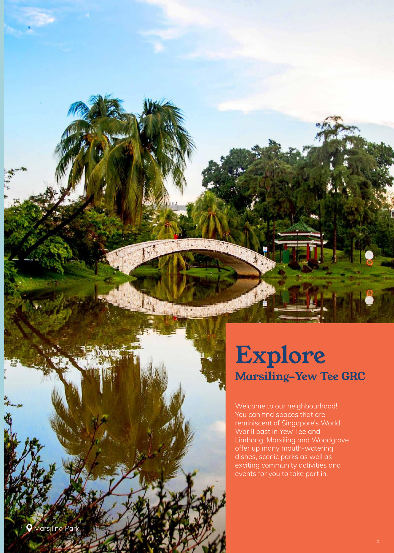
📍 Marsiling Park